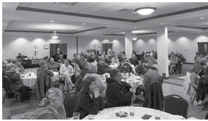
ADAMS COUNTY Township Officials Meeting.

with their conduct as the moderator, as judges of election under the provision of the general election law.